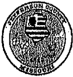
EXHIBIT A PENGAD 800-831-6986